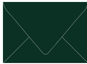
RACING GREEN (90, 60, 80, 60) White Ink Only