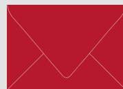
VERMILLION (9, 99, 84, 20) CMYK or White Ink