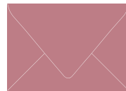
ROSE (15, 52, 29, 12) CMYK or White Ink