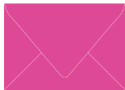
FUCHSIA (8, 86, 5, 0) CMYK or White Ink