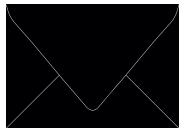
EBONY (70, 50, 20, 100) White Ink Only

The CMYK color builds provided below have been tested on our presses to produce the closest match for color envelopes. Please note the color builds are best used as a complementary color in your designs and will not produce exact matches. Since envelopes are dyed, printing a perfect color match is not possible. Large full coverage areas printed with CMYK builds to mimic the envelope color are not recommended.