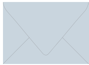
COOL BLUE (19, 9, 7, 1) CMYK Only