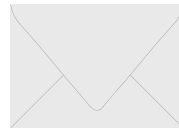
PALE GREY (8, 6, 6, 0) CMYK Only