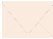
BLUSH (0, 7, 10, 1) CMYK Only