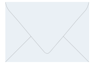
COOL GREY (7, 3, 2, 0) CMYK Only