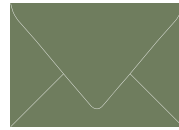
MID GREEN (60, 40, 70, 10) CMYK or White Ink