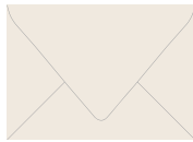
MIST (5, 7, 10, 0) CMYK Only