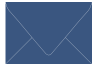
SAPPHIRE (85, 68, 27, 10) CMYK or White Ink