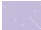
LAVENDER (21, 25, 0, 0) CMYK or White Ink