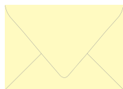
SORBET YELLOW (0, 0, 30, 0) CMYK Only