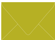
CHARTREUSE (5, 0, 90, 30) CMYK or White Ink