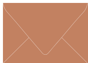
TERRACOTTA (5, 45, 55, 20) CMYK or White Ink