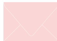
CANDY PINK (0, 19, 8, 0) CMYK or White Ink