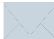
COOL BLUE (19, 9, 7, 1) CMYK Only