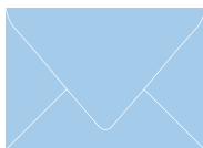
AZURE (23, 10, 0, 0) CMYK or White Ink