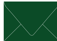
FOREST GREEN (96, 45, 100, 43) CMYK or White Ink