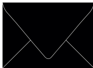
EBONY (70, 50, 20, 100) White Ink Only

The CMYK color builds provided below have been tested on our presses to produce the closest match for color envelopes. Please note the color builds are best used as a complementary color in your designs and will not produce exact matches. Since envelopes are dyed, printing a perfect color match is not possible. Large full coverage areas printed with CMYK builds to mimic the envelope color are not recommended.