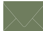
MID GREEN (60, 40, 70, 10) CMYK or White Ink