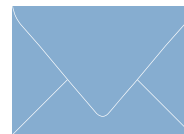
NEW BLUE (45, 20, 5, 3) CMYK or White Ink