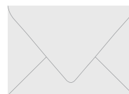
PALE GREY (8, 6, 6, 0) CMYK Only